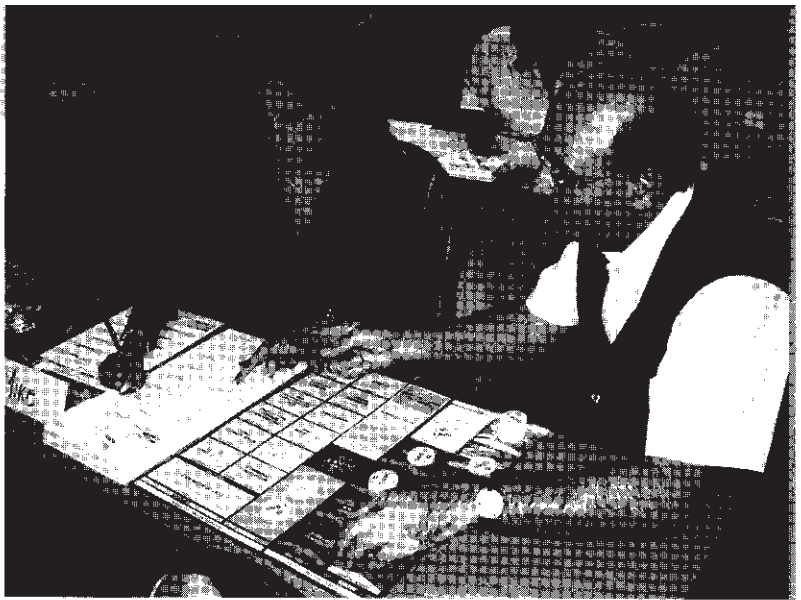
AME LEARNING INC. HELPS COMPANIES DEVELOP FINANCIAL ACUMEN TRAINING.